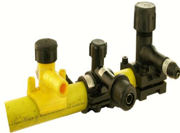
PLASTIC FUSION AND SADDLE TEES