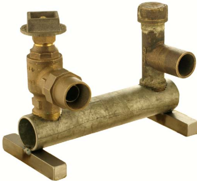
LOW PRESURE TEES

Examples of Low Pressure Tees for which we have manufactured Tooling.