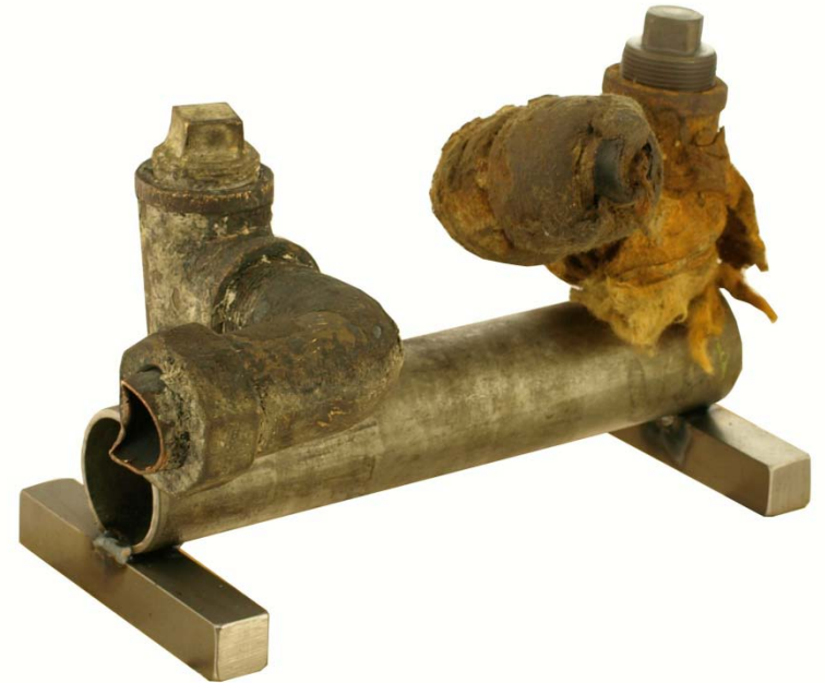
LOW PRESURE TEES