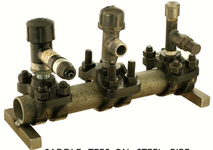
SADDLE TEES ON STEEL PIPE